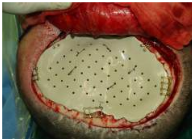
Fig. 5. Intraoperative photograph after dura tenting suture and fixation of the patient-specific polyetheretherketone implant.