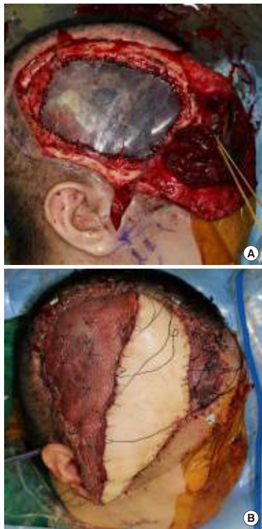
Fig. 2. (A) Intraoperative photograph after debridement and duroplasty. (B) The defect is covered with a latissimus dorsi myocutaneous free flap and split-thickness skin graft.

Nine days after the surgery, the skin graft became unstable, and necrosis of the flap was observed. MRSA and A. baumannii were reported from pus-like fluid accumulated under the flap. A detachment of the LD flap, debridement, duroplasty, and 17 \times 19 \text{ cm}^2 sized anterolateral thigh (ALT) myocutaneous free flap transfer were performed, and the ALT flap was taken suc-