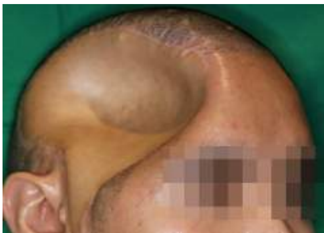
Fig. 3. Depression of the anterolateral thigh flap on the temporo-parietal cranial defect.

constructed scalp flap observed in the planning computed tomography (CT) scan to achieve a smooth and concave head shape considering (Fig. 4). During surgery, previously grafted ALT flap was successfully separated from the dura with careful protection of the flap pedicle. Pedicle identification and flap monitoring using Doppler were performed periodically. After the skull defect was fully exposed, bone margin debridement, dura tenting suture, and implant fixation with titanium hardware were performed (Fig. 5). Finally, the flap was sutured to the scalp flap in its original position with minimal tension. The depressed external contour was improved after the cranioplasty and the postoperative CT scan identified sufficient brain re-expansion and normalization of ventricle sizes (Fig. 6). There was no evidence of complications such as infection, wound dehiscence, or fluid collection over the 1-year follow-up period (Fig. 7).