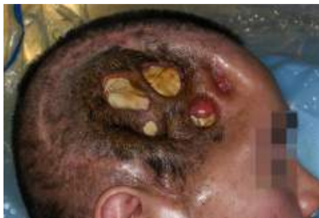
Fig. 1. Preoperative photograph of the skull and scalp defect on the right temporo-parietal area. The artificial dura is exposed. Klebsiella pneumoniae , methicillin-resistant Staphylococcus aureus , and Acinetobacter baumannii were identified in the wound culture.

Since resolution of the infection was a priority, removal of the