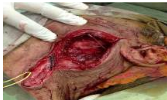
Fig. 4: The left facial vein was ligated and perforation of the left external carotid branch was repaired with prolene 6-0.

AV fistula on the other hand is a rare complication after mandibular fracture that could be fatal if left untreated as the result of massive blood loss after tooth extraction or attempts to remove or biopsy the lesion. 6