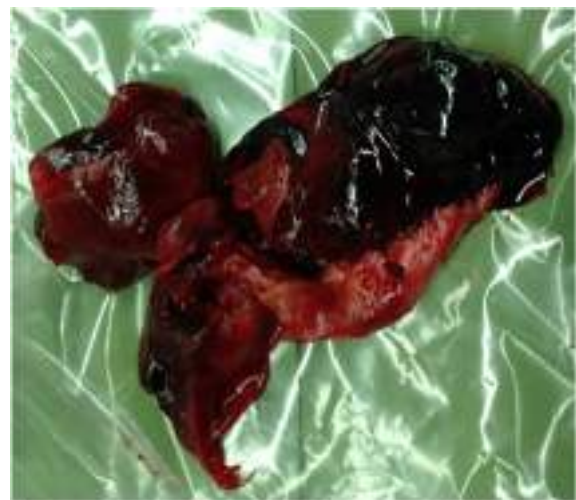
Fig. 3: A pseudo-aneurysm was detected between left external carotid branch and left facial vein that was excised.