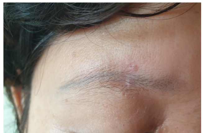
Fig. 4. Photograph 3 years after the second procedure. A linear scar was observed with an aesthetically excellent outcome.