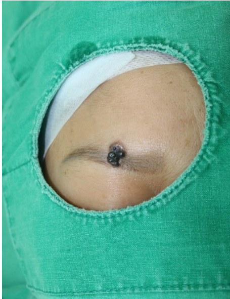
Fig. 1. A 48-year-old woman with basal cell carcinoma in the right eyebrow. An irregularly protruding, darkly-colored basal cell carcinoma measuring 1.2×0.7 cm is observed in a tattooed eyebrow.