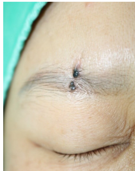
Fig. 3. Remnant basal cell carcinoma after the first procedure.

Since the first report by Bashir [2] in 1976 of the occurrence of BCC in a tattooed area, several cases have been reported. The current report presents the second known case of BCC in a tattooed eyebrow [3], according to a literature search in PubMed