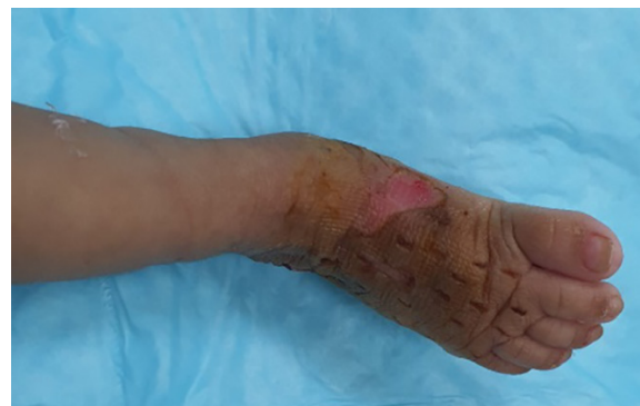
Fig. 2: Appearance of the right foot after 1 week showing almost complete resolution with a small area of desquamation on the medial aspect which healed conservatively.