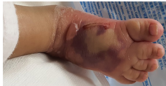
Fig. 1: Extravasation injury of the dorsum of right foot following 10% dextrose IV infusion.

The dressing was repeated every day for a week, and after that, the patient was transferred to another facility and unfortunately was lost to follow up. Based on the clinical features, we can grade extravasation injuries as mild, moderate and severe, which will guide us in managing these injuries (Table 1). We have proposed an algorithm in the management of extravasation injuries based on the grade of injury too (Figure 3).